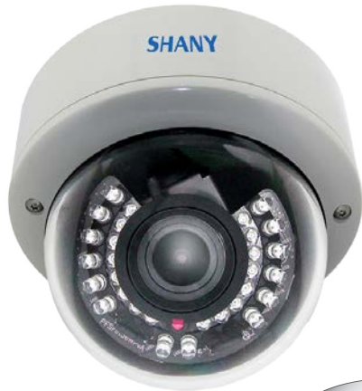
Sony Effio A 750TVL