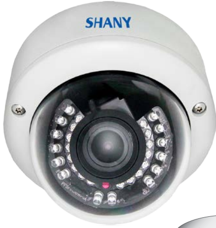
Sony Effio A 750TVL