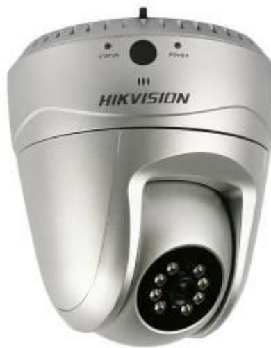
DS-2CD727(W) / 728PF-PT(W)