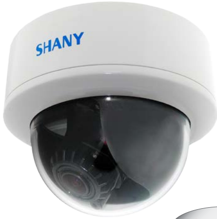
Sony Effio A 750TVL