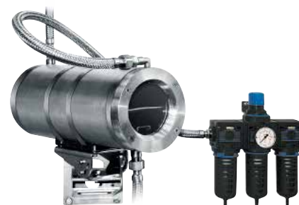
NXW + NXFIGRU + NXWBS