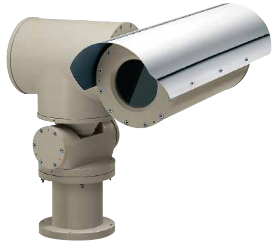
EXPTC010G + EXPTS

The P&T functions are controlled by the EXDTRX telemetry receiver..